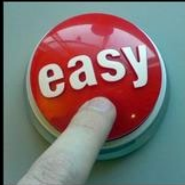
What my clients think I do