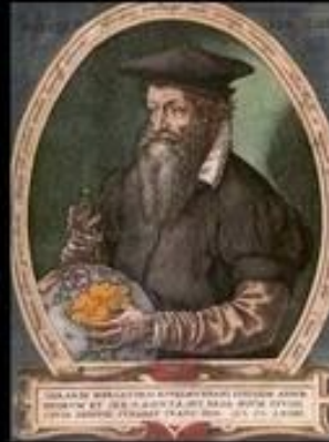
What my mom thinks I do