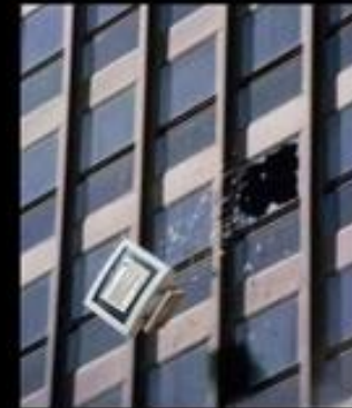
What I really do